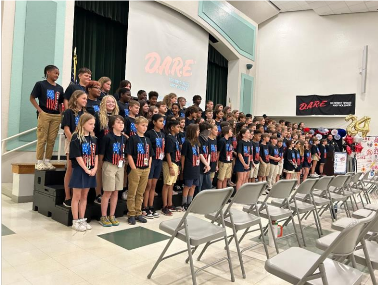
The 2024 DARE program graduation ceremony at Sallie Jones Elementary School Friday morning.