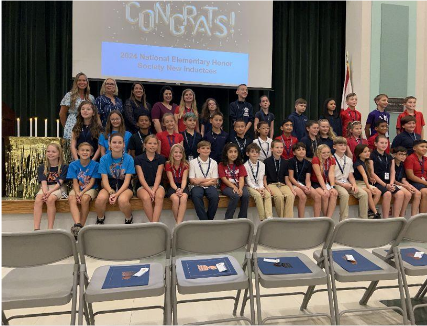
Congratulations to the Sallie Jones Elementary School Honor Society inductees.

Here is your Weekly Highlights Report for May 3, 2024. For the complete report from the City, click HERE .