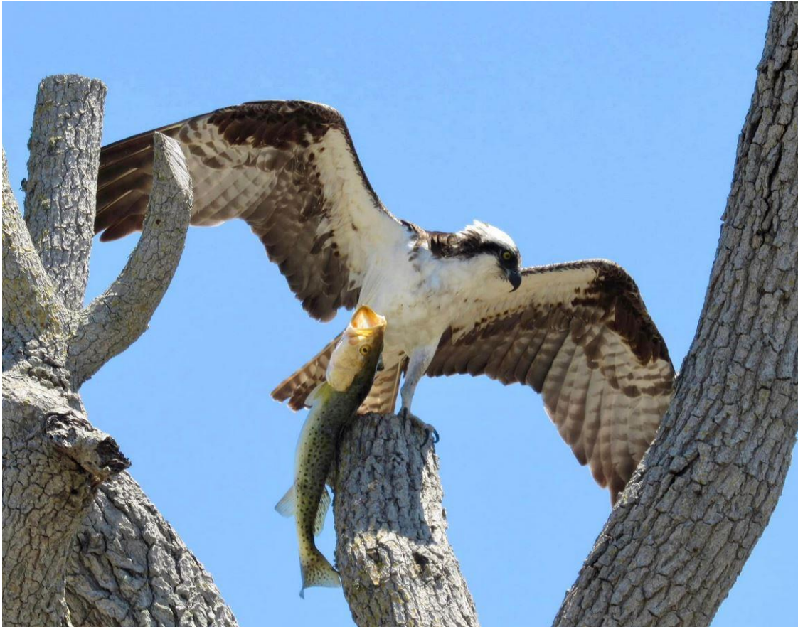
Fresh catch for lunch.

Here is your Weekly Highlights Report for April 26, 2024.