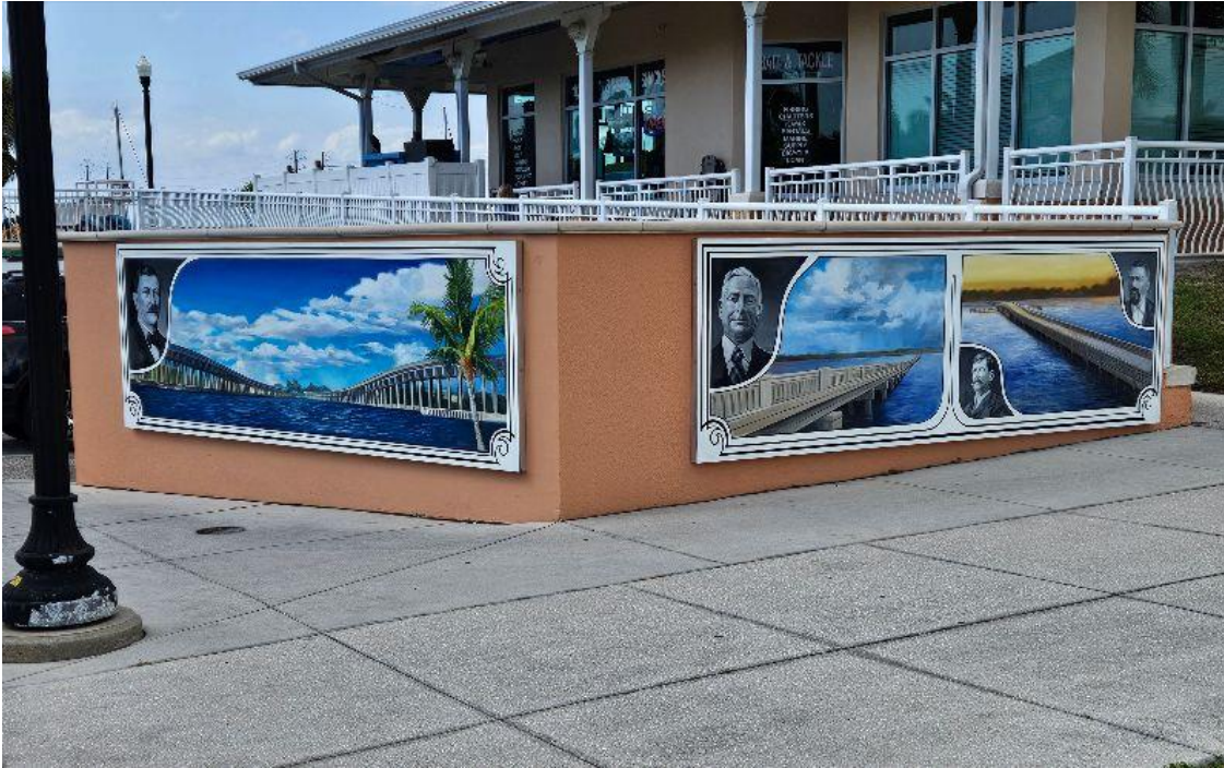
The all new Harbor Bridges mural at Laishley Marina, to be dedicated next Wednesday, April 24 at 4 p.m.

Here is your Weekly Highlights Report for April 19, 2024. For the complete report from the City, click HERE .